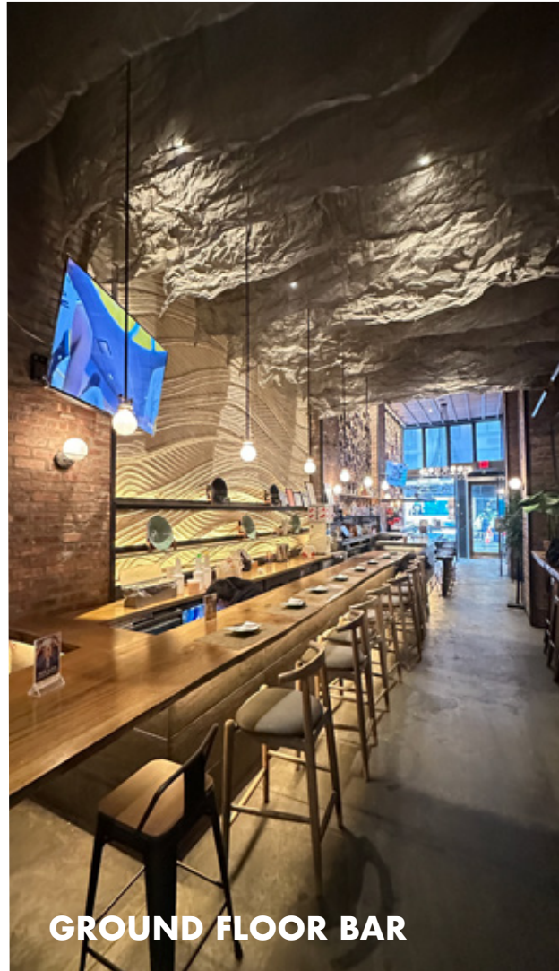
GROUND FLOOR BAR