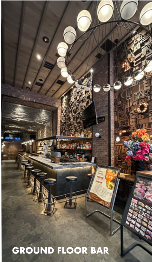
GROUND FLOOR BAR