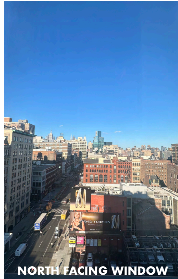
NORTH FACING WINDOW