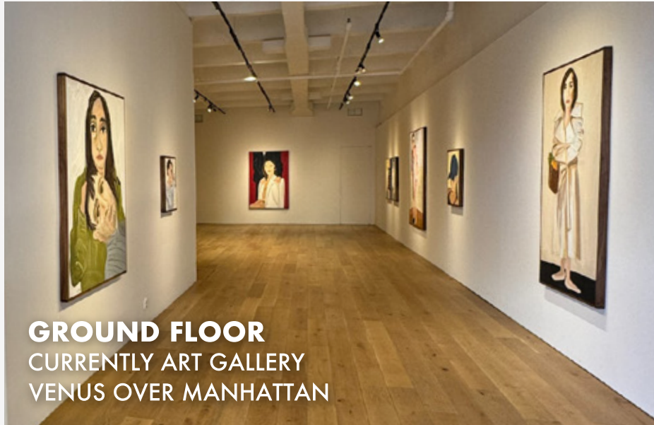
GROUND FLOOR CURRENTLY ART GALLERY VENUS OVER MANHATTAN