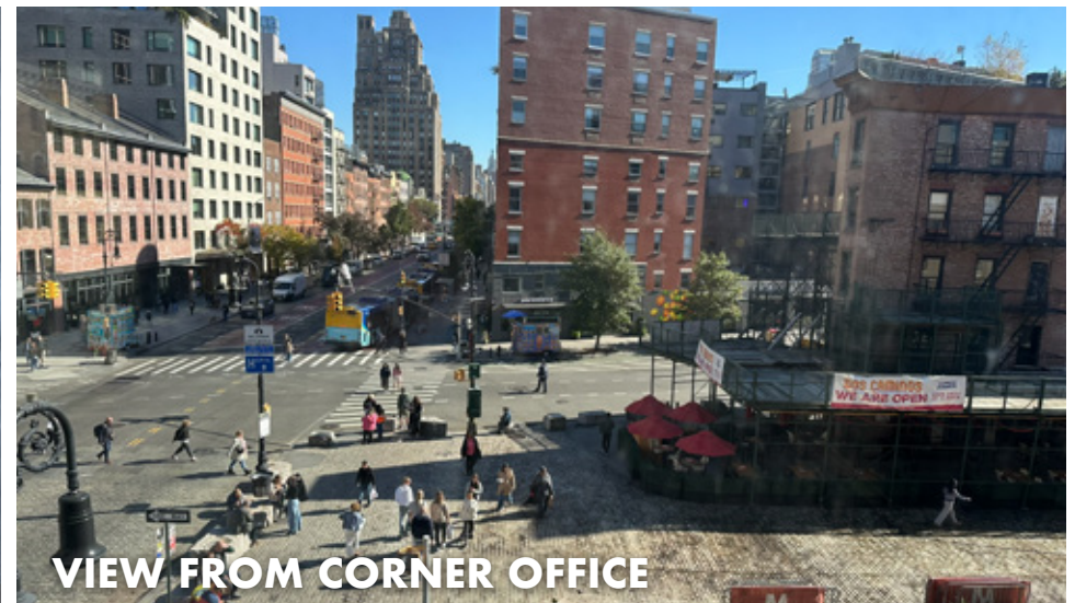
VIEW FROM CORNER OFFICE